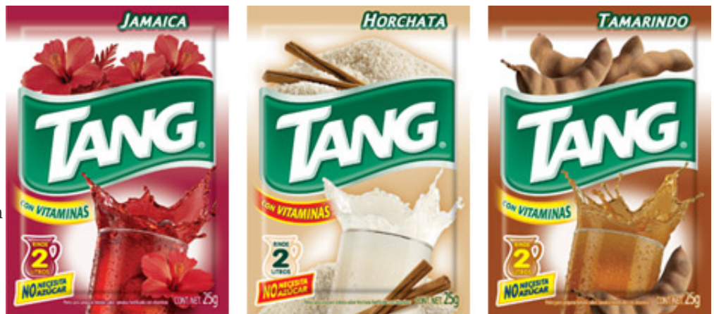
Tang's localized flavors are boosting sales.

1. Picking the best bets. The first step in a blank check initiative is for the business leaders to choose the business domains that should be