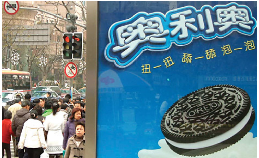
A blank check initiative made Oreo the top-selling cookie in China.

Today, Kraft Foods China is a success story: The team doubled their innovation rate, transformed Oreo into the number one selling biscuit in China, and posted net revenues of more than $800 million in 2011. Today the business’s advertising spend exceeds the business’s revenues in 2006. Most importantly, Kraft Foods China has a sustainable business model that is delivering a virtuous cycle of growth and is among the fastest-growing CPG companies in China today.