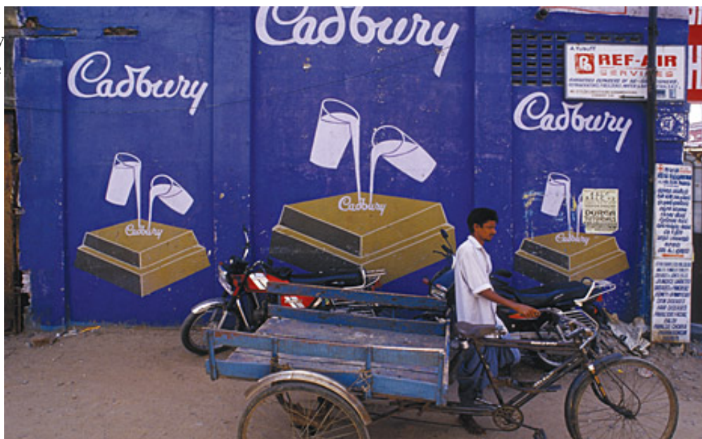
Kraft India increased investment in Cadbury advertising and promotions by 45 percent.