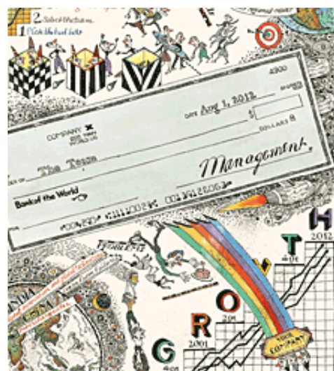
Illustration by Jack Unruh

In 2007, Kraft Foods Inc. was facing a major challenge with Tang — the powdered breakfast drink that had long been one of its iconic brands, made famous in the 1960s when the National Aeronautics and Space Administration included the drink in the rations for U.S. astronauts. The brand was caught in a cycle of underperformance — a situation that commonly bedevils companies as they seek to drive organic growth. In 2007, the leadership team of Kraft's developing markets identified Tang as one of their top 10 focus brands, and came up with an unusual strategy for boosting the brand's sales back into the stratosphere: Tang leaders in key countries such as Brazil were given a "blank check," essentially urging them to dream big and not worry about resources. The results have been astounding. In the last five years, Tang has doubled sales outside the U.S. and become a profitable, US$1 billion brand there (in comparison, it had taken Tang 50 years to reach the $500 million revenue mark). The transformation of brands like Tang helped grow Kraft Foods' developing markets business from $6 billion in revenues in 2007 to more than $15 billion in 2011, significantly improving margins.